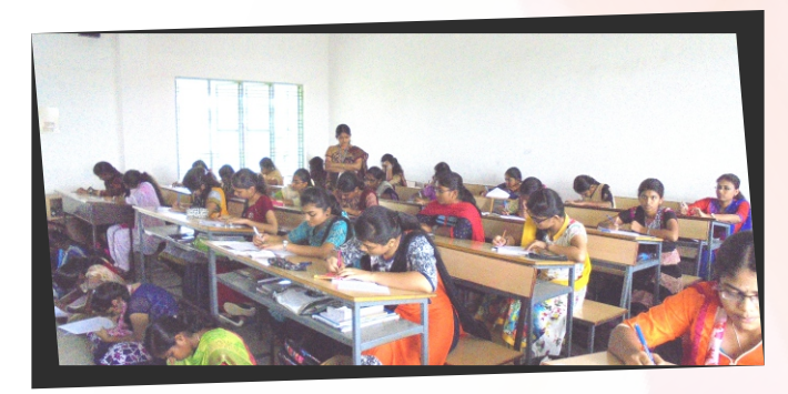
Release of News letter

The first year students and their parents were oriented about the functioning of the institution and the department. (22.06.2018)